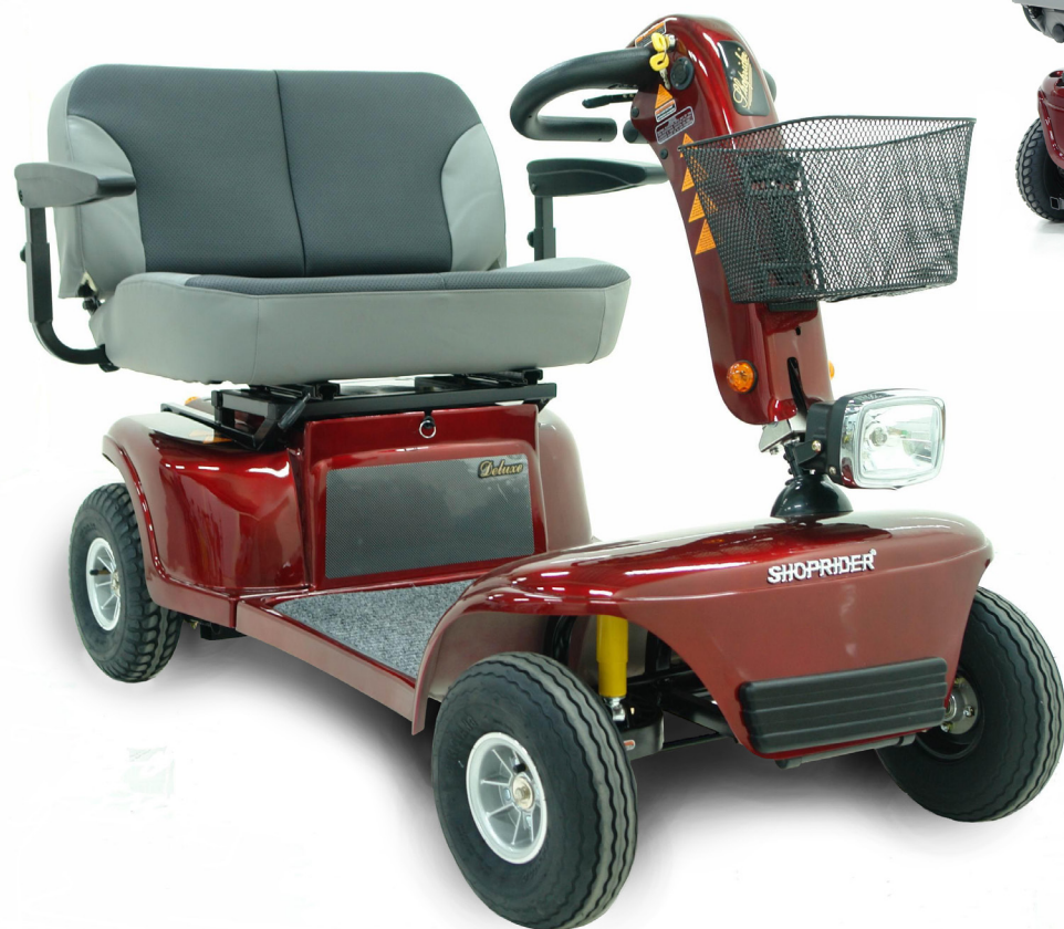
889D BURGUNDY RED