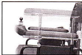
Adjustable Height Arm Rest