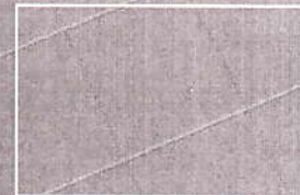
Oxygen Bottle Holder