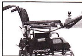
Adjustable Length VSI Controller

The FPC easily folds to keep you on the go!