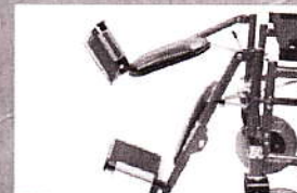
Elevating Leg Rest