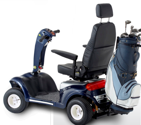
Optional GOLF BAG CARRIER (SE-GBM) can be fitted to scooter (Not included - Sold separately)